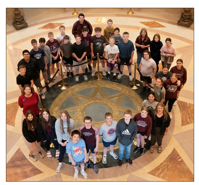
8<sup>th</sup> graders from New Ulm Area Catholic Schools