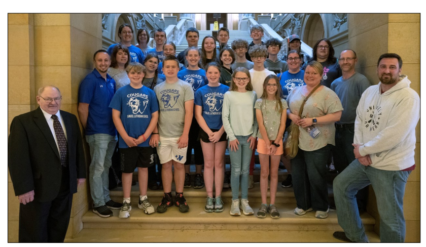
6^{\text{th}} - 8^{\text{th}} graders from Samuel Lutheran School in Marshall

★ 5<sup>th</sup> and 6<sup>th</sup> graders from St. Edward School in Minneota